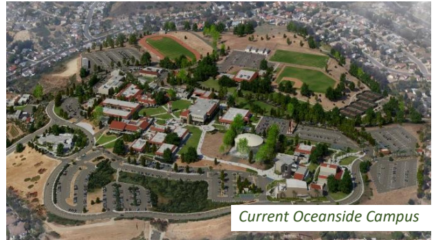
Current Oceanside Campus

Measure MM, the $455 million bond passed in November 2016, will fund the implementation of the Facilities Master Plan for the Oceanside Campus, which looks to create a strong organization structure to unify the campus. It focuses on the renovation and modernization of existing facilities to provide flexible and interactive 21st century learning environments, transforming interior environments with technology upgrades, updated finishes, furniture and equipment to promote collaborative learning, and expanding available tutoring and studying spaces throughout the campus.