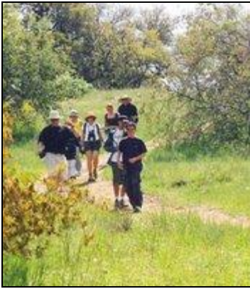
MiraCosta Hikers on Lomas Trail