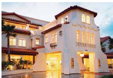
Carlsbad By The Sea Retirement Community