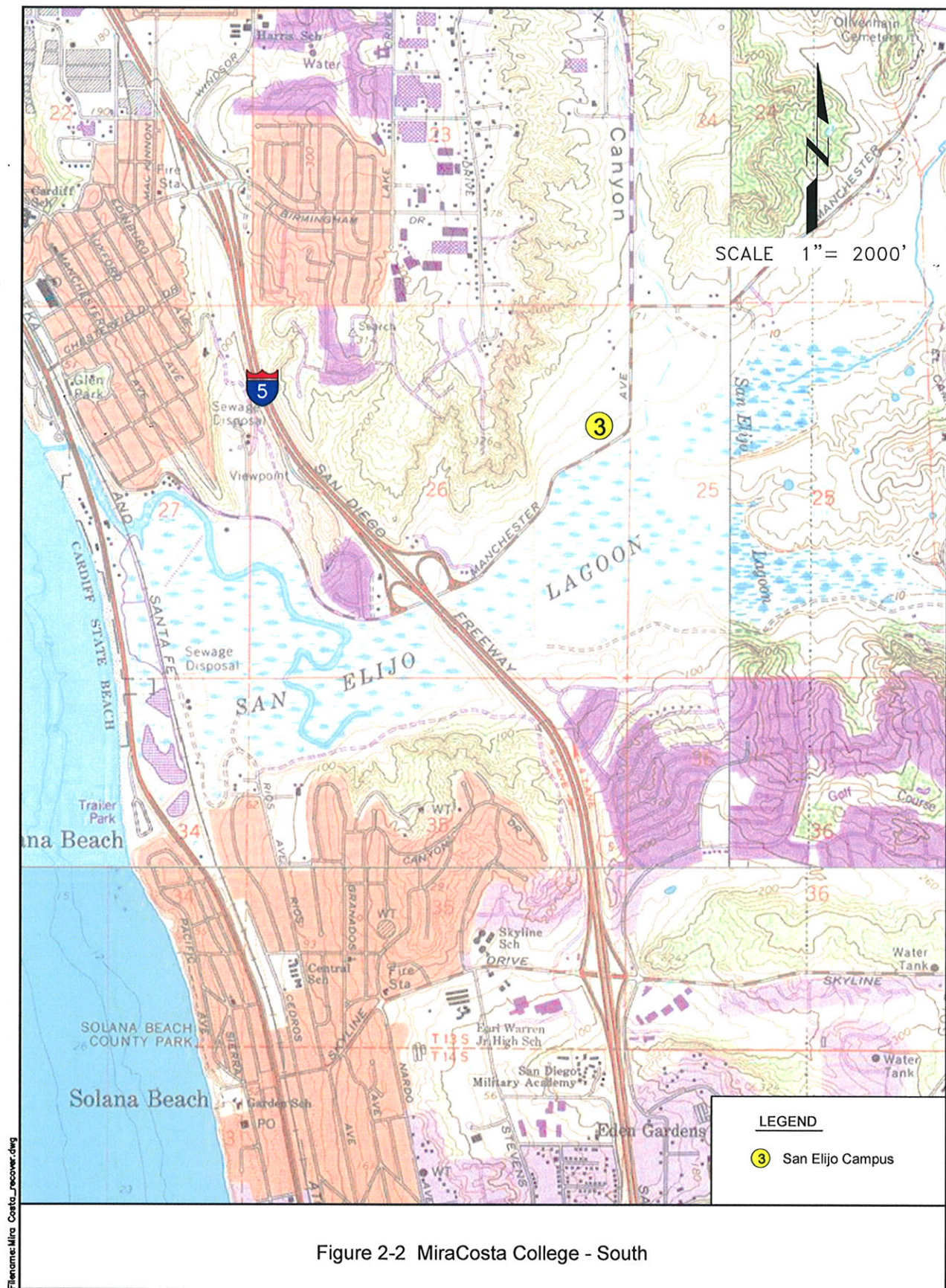
Figure 2-2 MiraCosta College - South