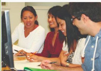
Continuing Education Students