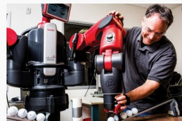
Community Education & Workforce Development Students