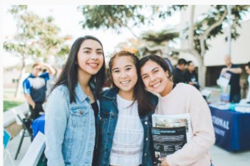
High School Students