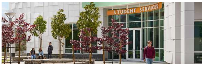
COMMUNITY LEARNING CENTER