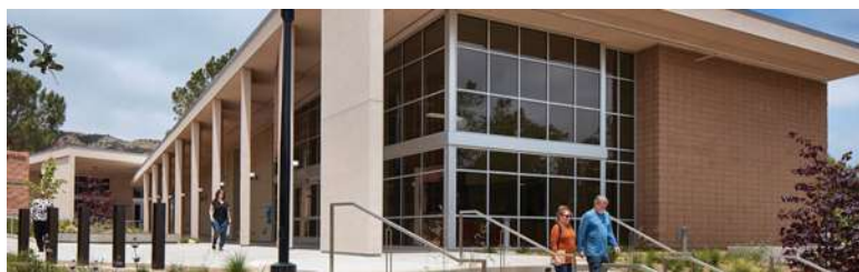
SAN EL JO