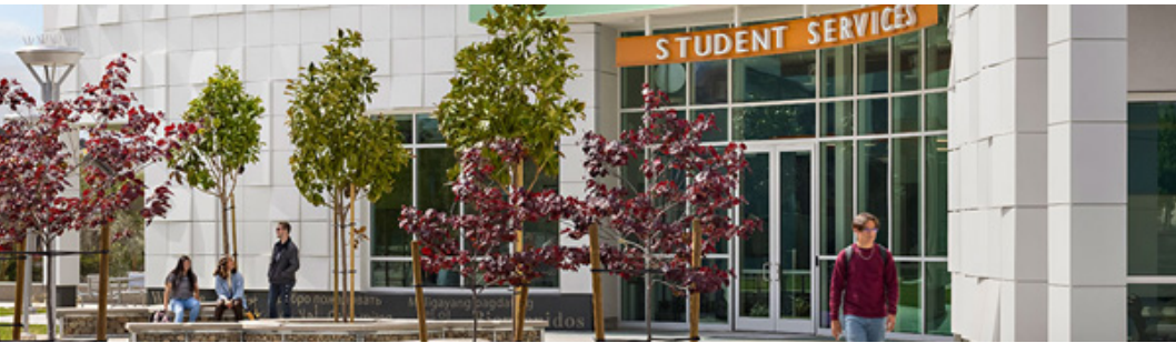
COMMUNITY LEARNING CENTER