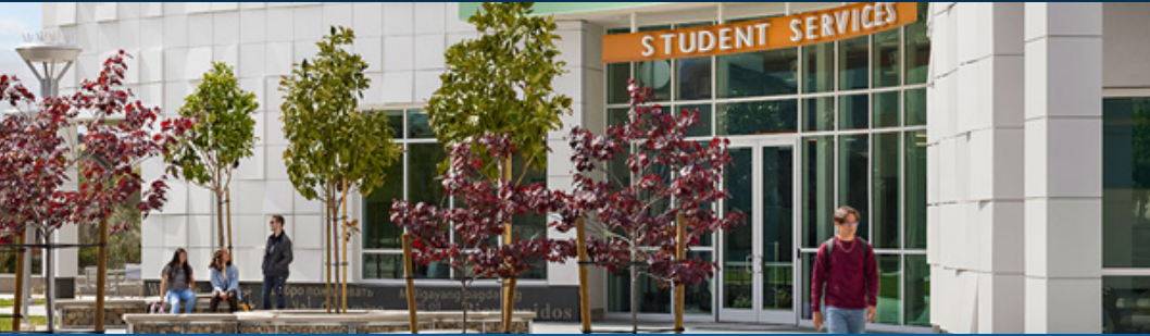
COMMUNITY LEARNING CENTER