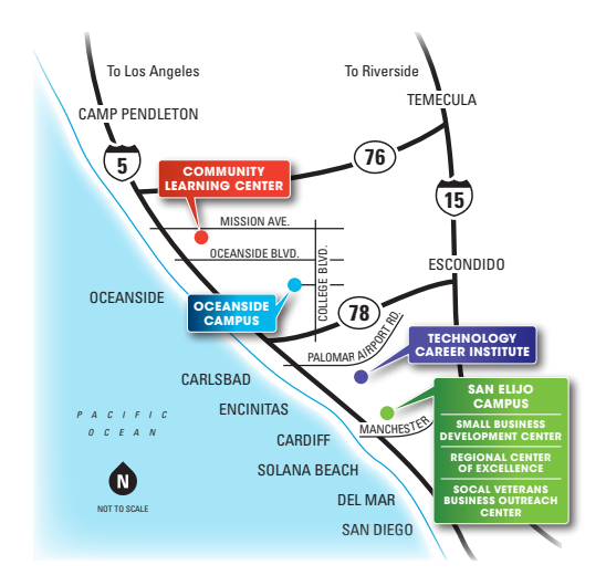
MIRACOSTA COLLEGE Mathematics miracosta.edu/math